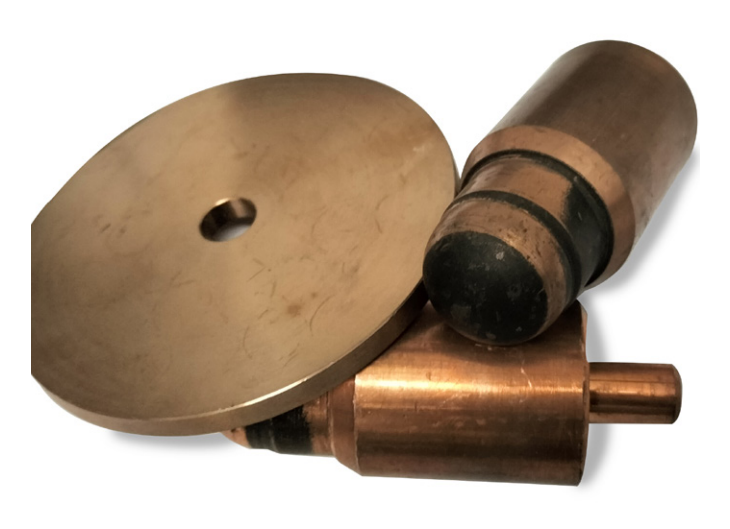
EER 12.01.03 / 12.01.21