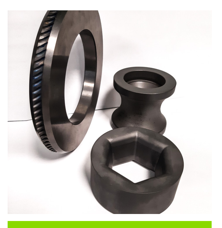
EER 12.01.03 / 12.01.21 / 12.01.99

Solid parts Wc-Co with total metal binder > 11% wt% and possible Ni content in the binder < 50% wt%.