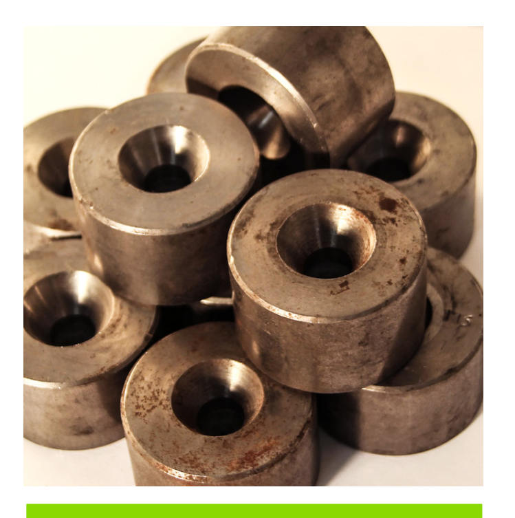
EER 12.01.01 / 17.04.05