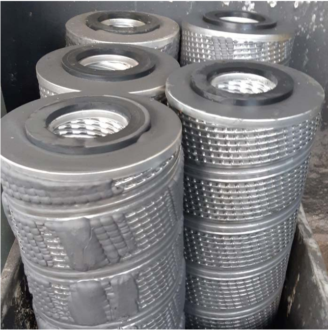
EWR 15 02 03

Cartridge, pocket, paper filters from dust collectors.