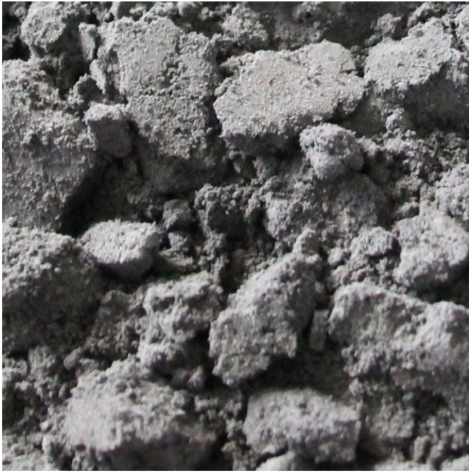
EWR 12 01 04

Cartridge, pocket, paper filters from dust collectors.