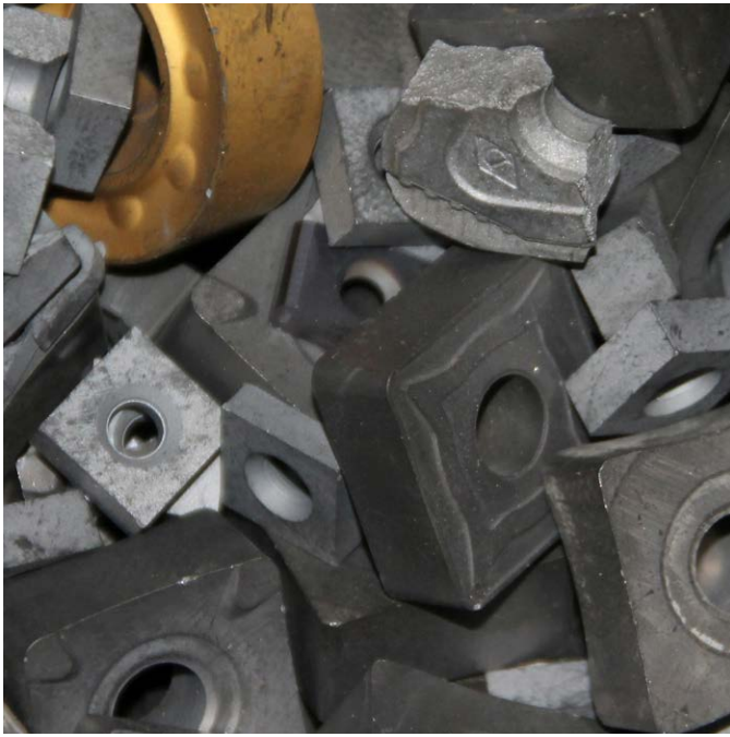
EWR 12 01 03 / 12 01 21 / 12 01 99

Solid Wc-Co parts with metal binder content > 11%.